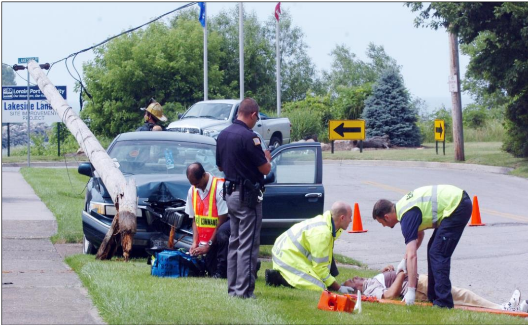
A Car Accident

G-Write a short paragraph of about ( 6 sentences ) about ((A car accident)) with the help of these guide questions: