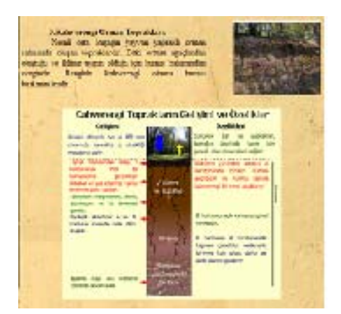
Figure 3: Presentation Page