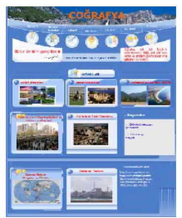
Figure 1: Unit Introduction Page

The announcements section includes questions for students, activity assignments, and other announcements concerning the application.