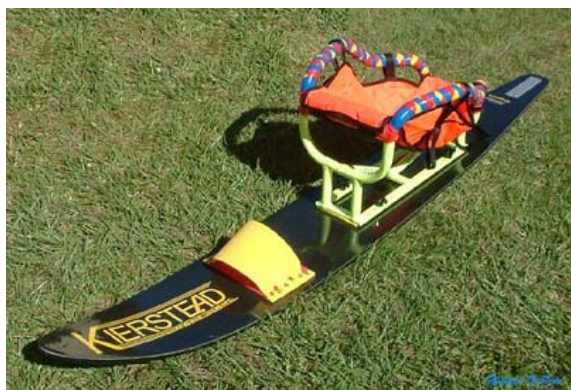
Figure 8: The Sit-Ski from Kierstead Water Skis allows individuals to water ski in a seated position while being held securely in place by a custom-fitted cage.