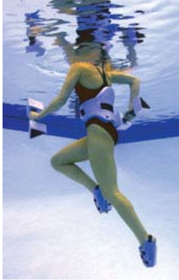
Figure 10: The AquaJogger from AquaJogger, a division of Excel Sports Science, is a flotation belt that enables individuals to stay upright in water while jogging or doing resistance exercises.