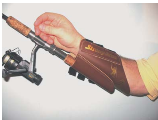
Figure 9: The Strong Arm Rod Holder from Access to Recreation straps to the wrist and forearm to enable persons with limited or no grip to fish.

Fishing is another popular aquatic recreational activity. Many devices are available to help make fishing easier for individuals with physical disabilities. These include devices to aid in cutting and tying fishing line and devices to aid in holding a fishing rod. For people with upper extremity amputation, there are terminal devices that allow a fishing rod to be attached to the end of a prosthetic arm.