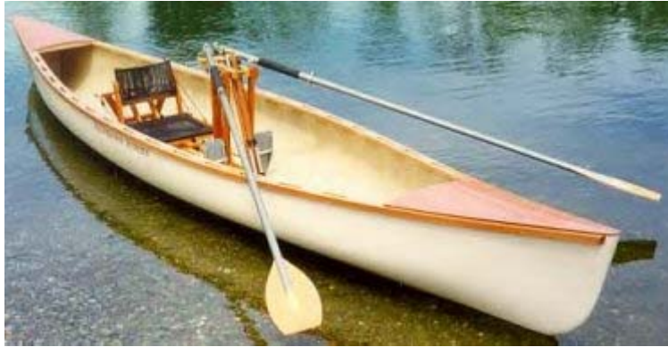
Figure 7: The FrontRower from Ron Rantilla Rowing Systems lets the rower face forward in a canoe or narrow rowboat, using any combination of upper or lower limbs to row.

In addition to adaptive boats that are designed to meet the needs of people with disabilities, there are also systems for adapting standard boats. These include a custom-configured elevating deck to provide dock-to-deck wheelchair access for a yacht or other boat, and a rowing system that enables a rower to row with two limbs in any combination (two arms, two legs, or an arm and a leg).