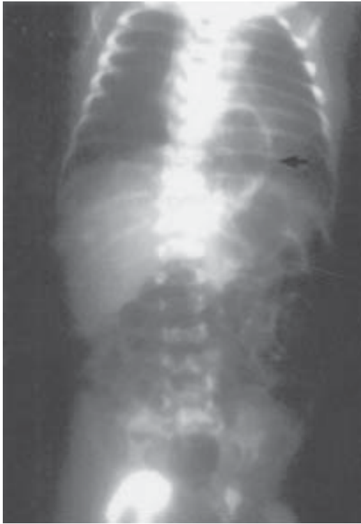
Fig 1. Infantogram (A-P view) of case 1 showing a gas filled cystic lesion (arrow) in the left lower chest.