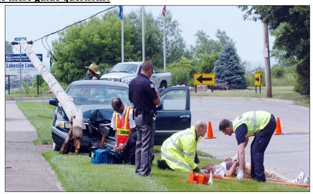
A Car Accident

A-Write a short paragraph of about (6 sentences) about ((A car accident)) with the help of these guide questions: